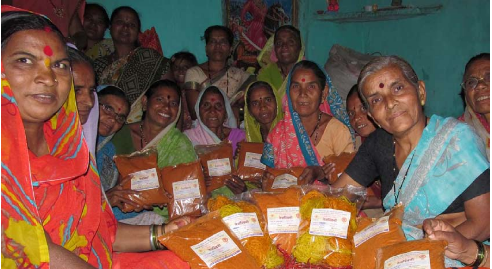
Savitribai Phule SHG members display their packaged chilli powder and kurudai snack.

Her achievements, she feels, are just the beginning to many more plans she has for Vavad. "First and foremost, we need a chilli grinding machine because it will reduce our time and labour," she tells me in a serious tone, and continues, "Then, we should buy a dal (pulses) processing unit – that will be Savitribai Phule SHG's business venture for the future!"