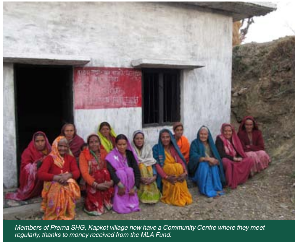
Members of Prerna SHG, Kapkot village now have a Community Centre where they meet regularly, thanks to money received from the MLA Fund.