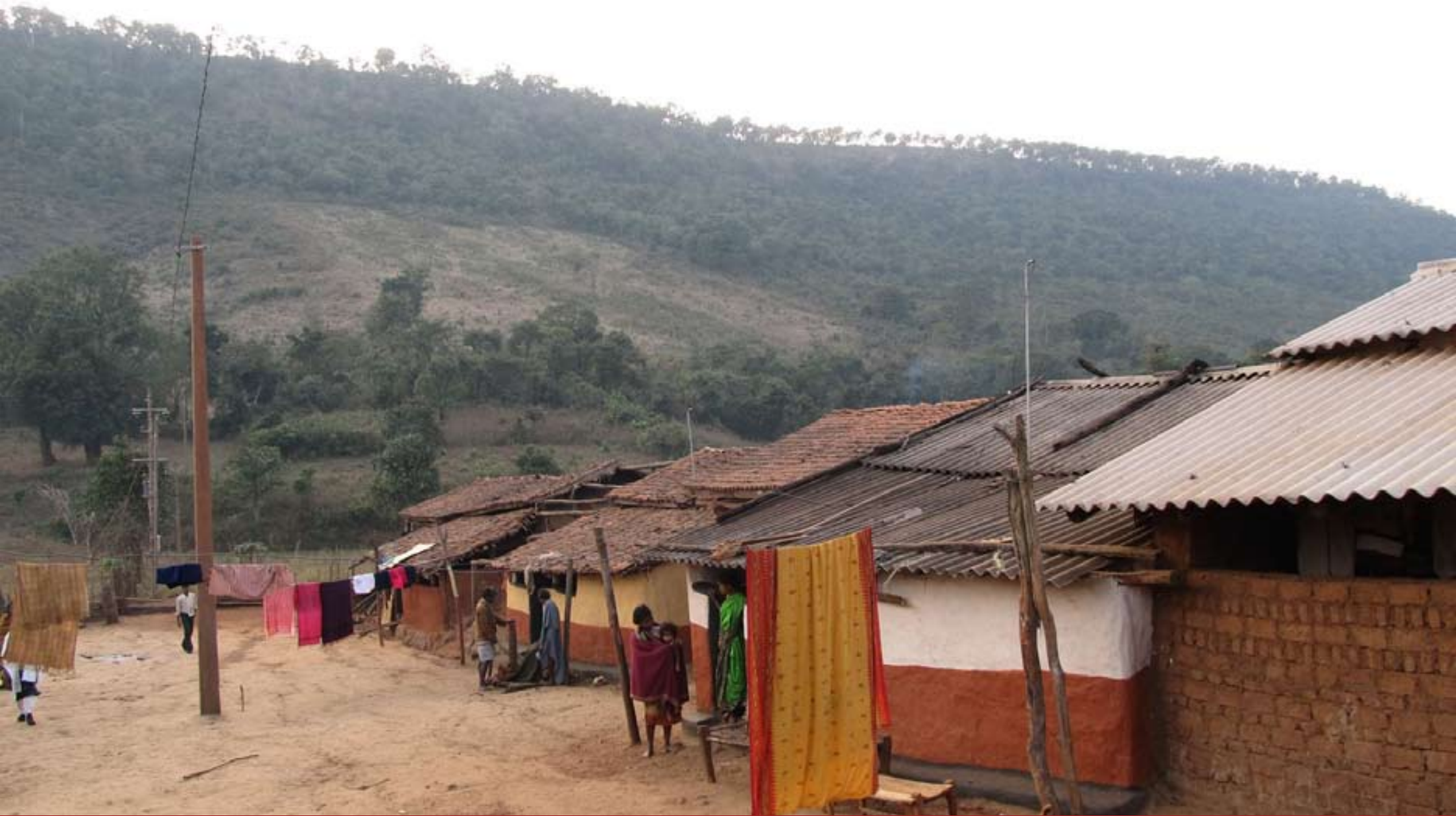
Podu (shift) cultivation rampant in Ushabali village since villagers don't have their own lands.