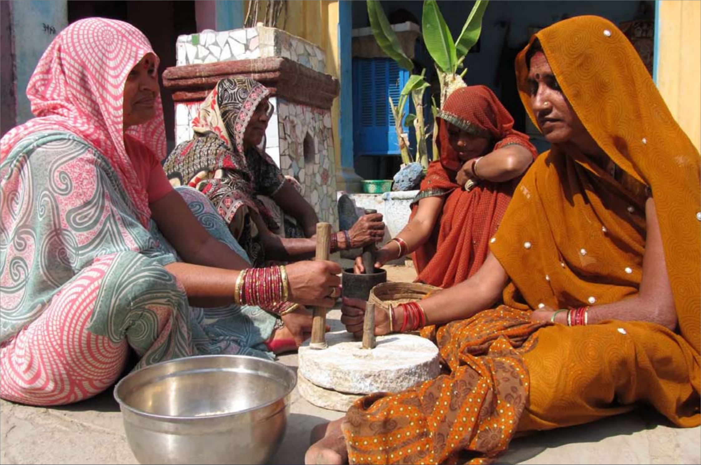
Women of Urdmau village (a male-dominated Bundelkhand region) engaged in household chores.