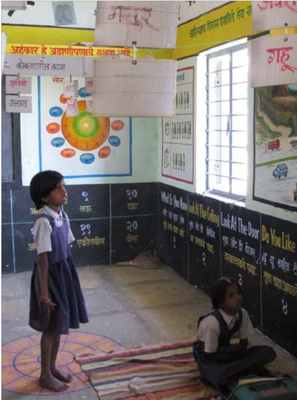
Students from Wani Sambhapur and Rajapur enjoying the interactive methods used to educate them.