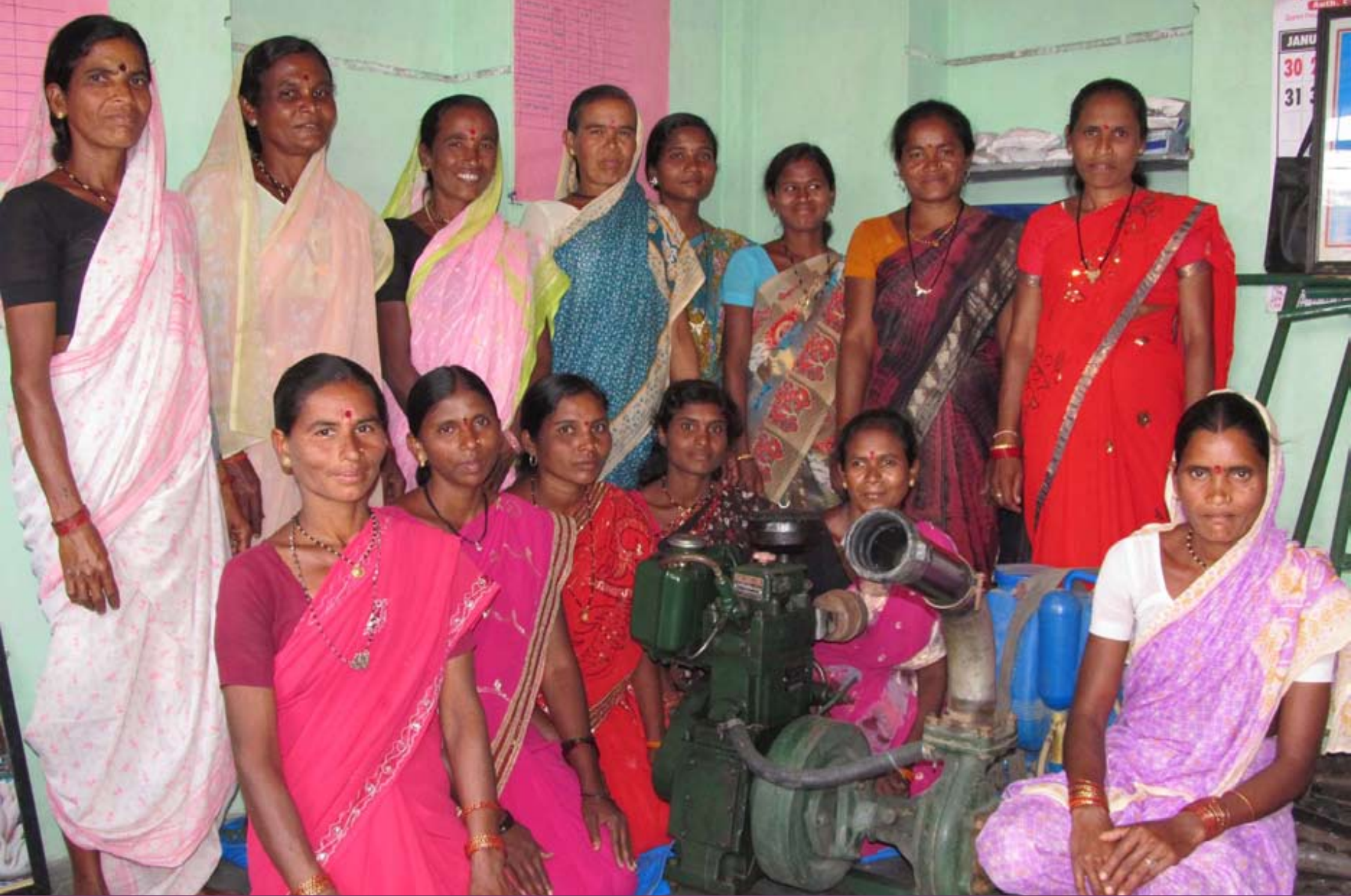
Mahila SHG members display a diesel engine, three weeding machines and two fertilizer pumps they procured via ABG to reduce drudgery.