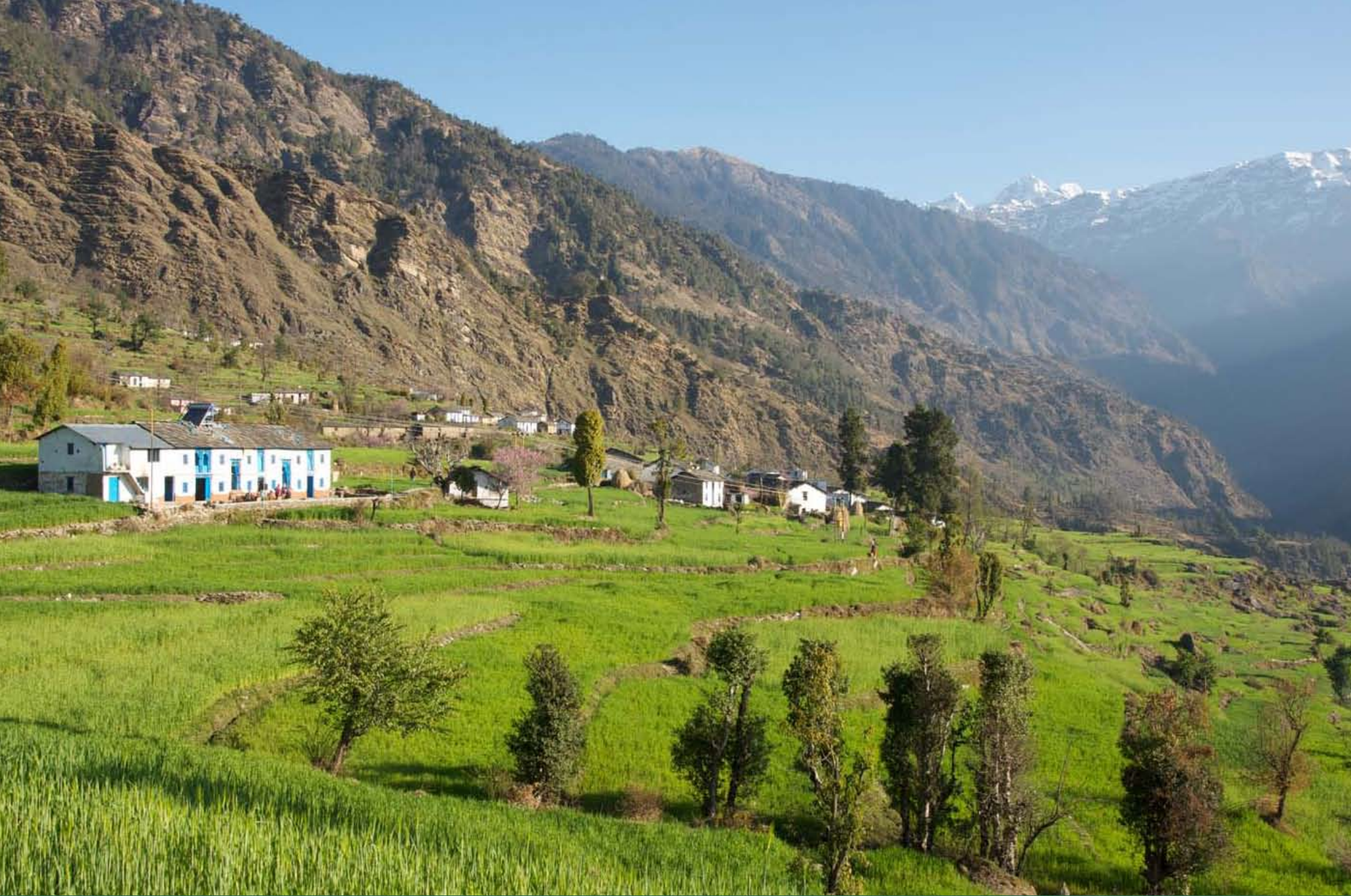
The Supi village guest house with the blue windows.