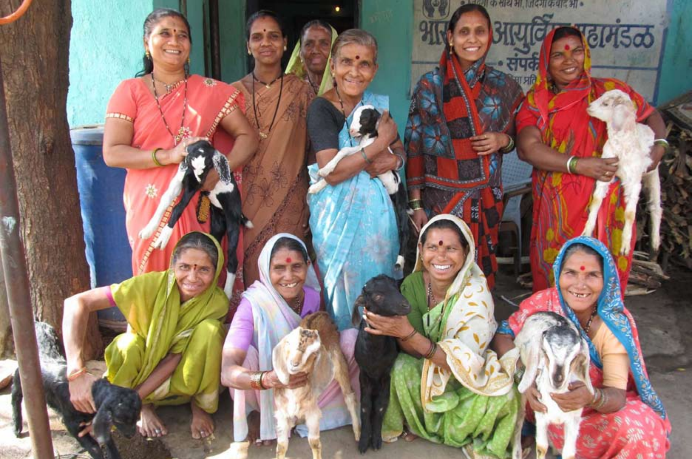
Members of Savitribai Phule SHG are rearing goats, thanks to a bank loan.