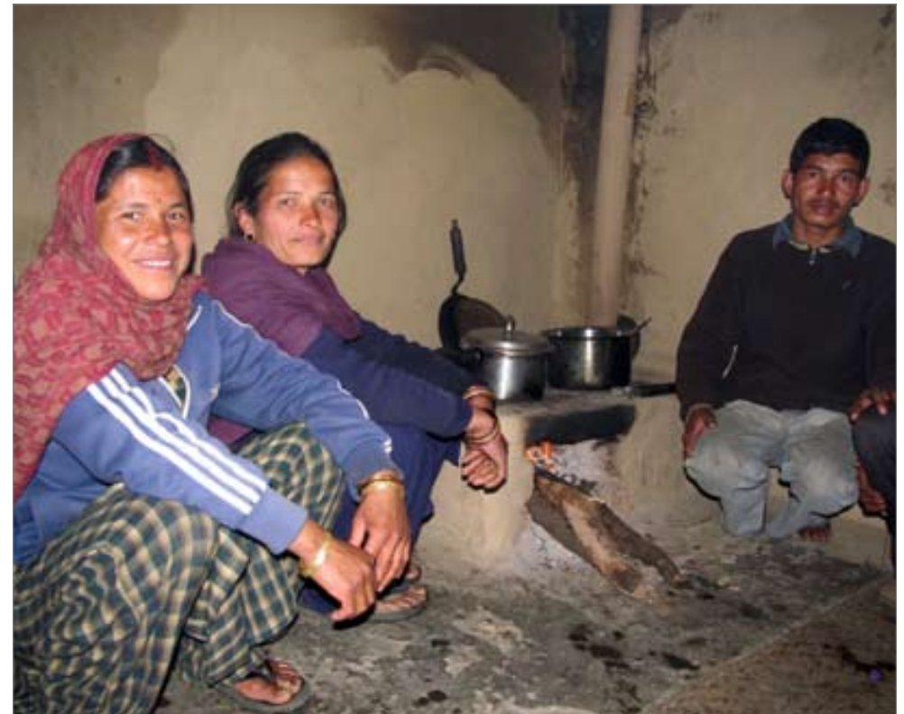
The little kitchen at Supi guest house; cooks preparing traditional Indian food for the visitors.