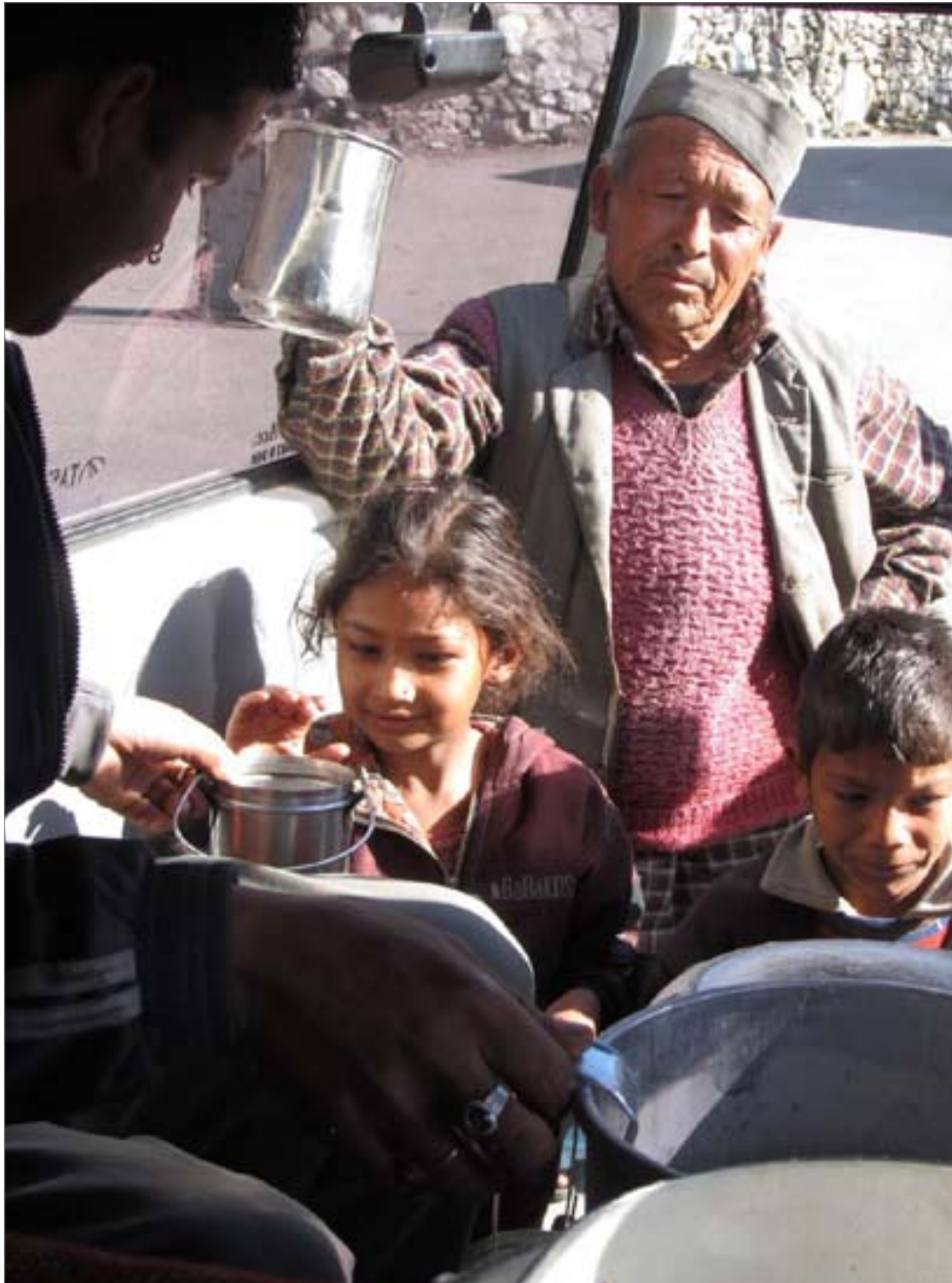
Public transport is used as mobile milk distribution units and milk is sold at designated junctions throughout Dasholi Block.

up to 20 AI in a breeding season,” Darshan Singh confirms. Demand and supply of fodder is also managed via the Co-operative and Surma Devi is responsible for the smooth functioning. “We maintain registers for incoming and outgoing stock, and see to it that our farmers are happy with our services,” she informs.