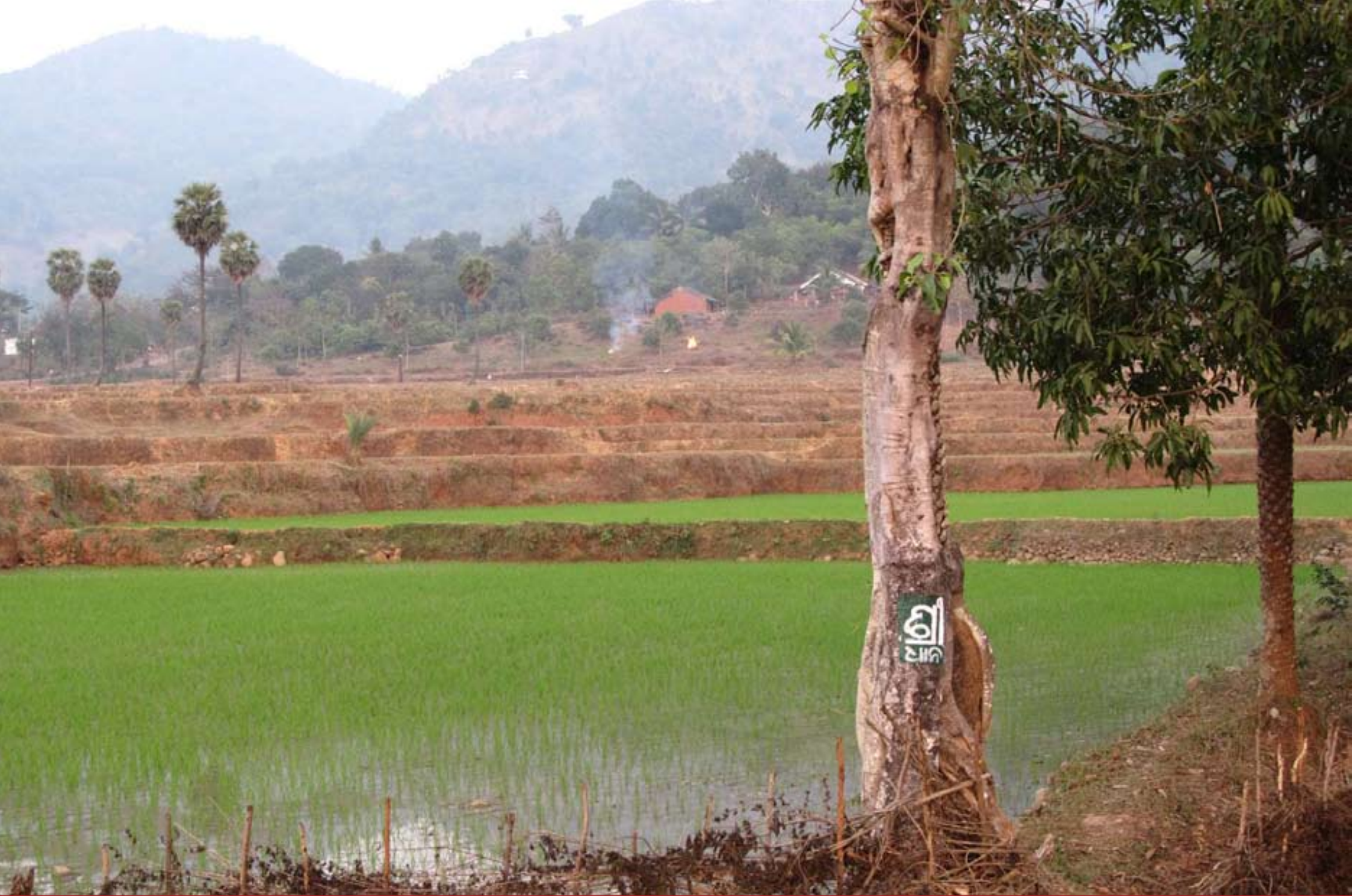
System of Rice Intensification (SRI) method of cultivation adopted by many Tumulo village farmers freeing them from the low-yield perennial problem.