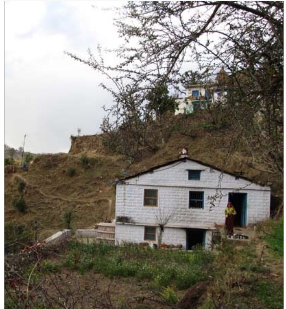
Poojargaon village, Uttarakhand.

Kausa has always taken the lead when it came to social and village activities. She gives me an example of how she changed the mindset of the villagers when it came to re-marriage for women. “I made the men of the village understand that women