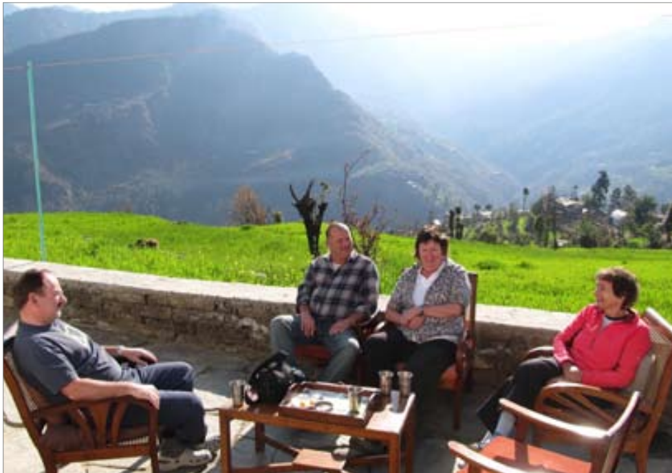
Guests at Supi enjoying the hospitality and experience.