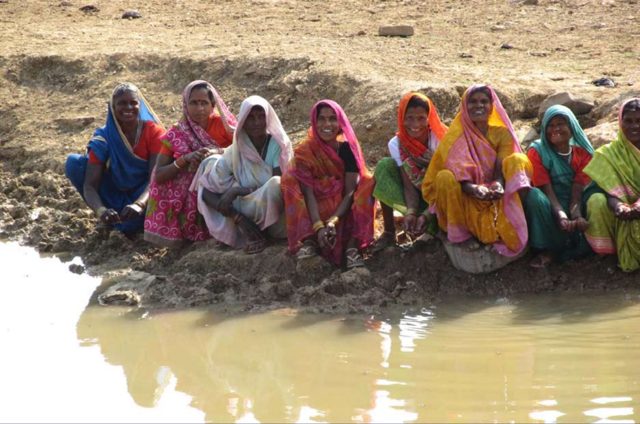
Women at the proposed site where there is enough raw materials for a probable brick kiln under Pawai Adimzati scheme.