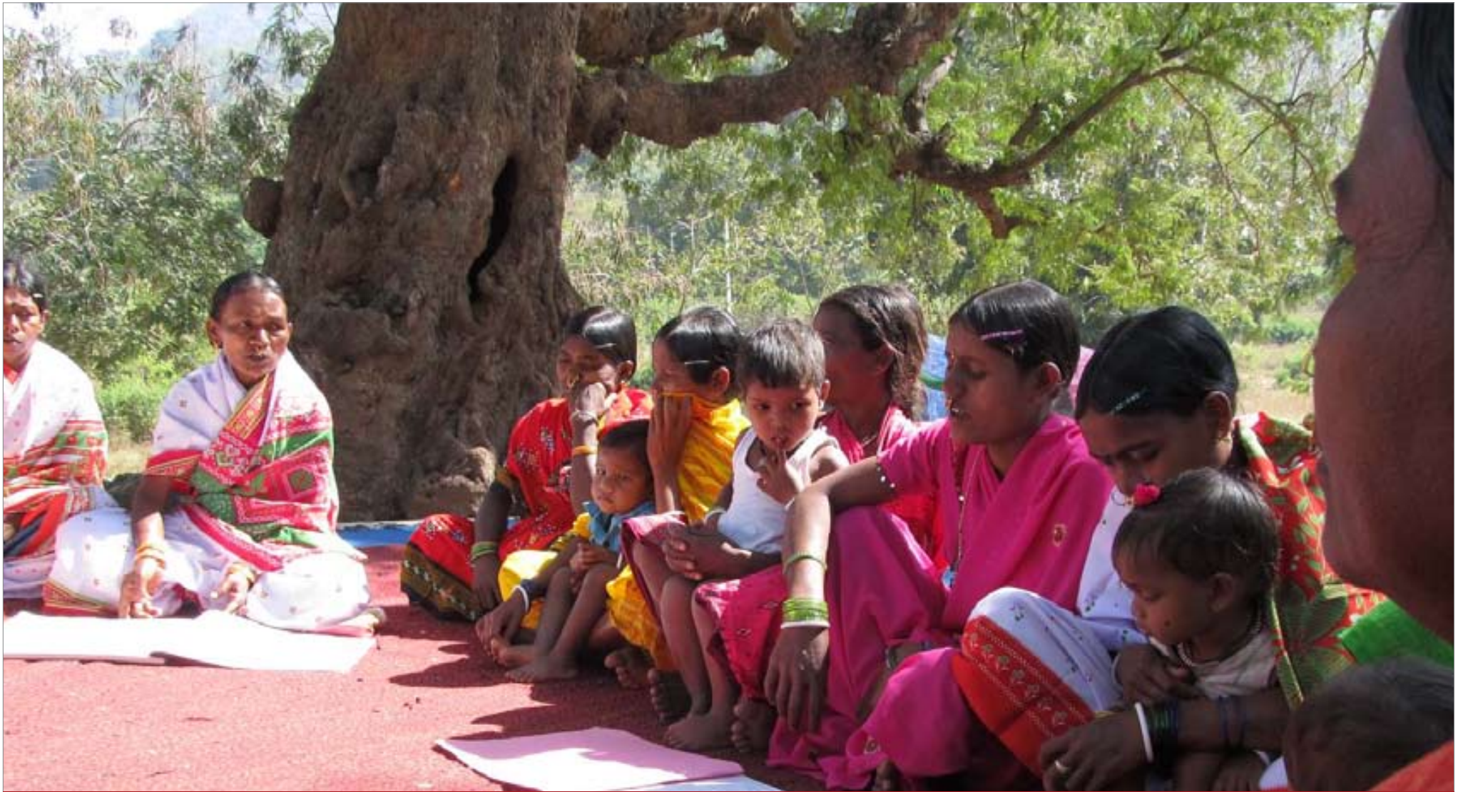
Penubandha SHG meeting in progress under the banyan tree. The women are discussing the possibility of increasing the rate of monthly member-contributions.

Bijay Misra of Vikas, a FNGO working in the village, explains that tribals have never had a tradition of saving. “When they don’t have work or money they migrate,” Bijay informs. “The problem is serious with the landless families, and therefore, it is necessary to provide alternative livelihood options to this community so that they will want to remain in their village and also learn to save from a sustained