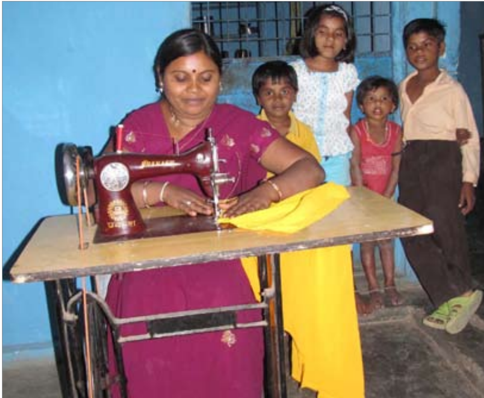
This SHG member from Tandulwadi village has bought a sewing machine via internal lending and is making a decent living.