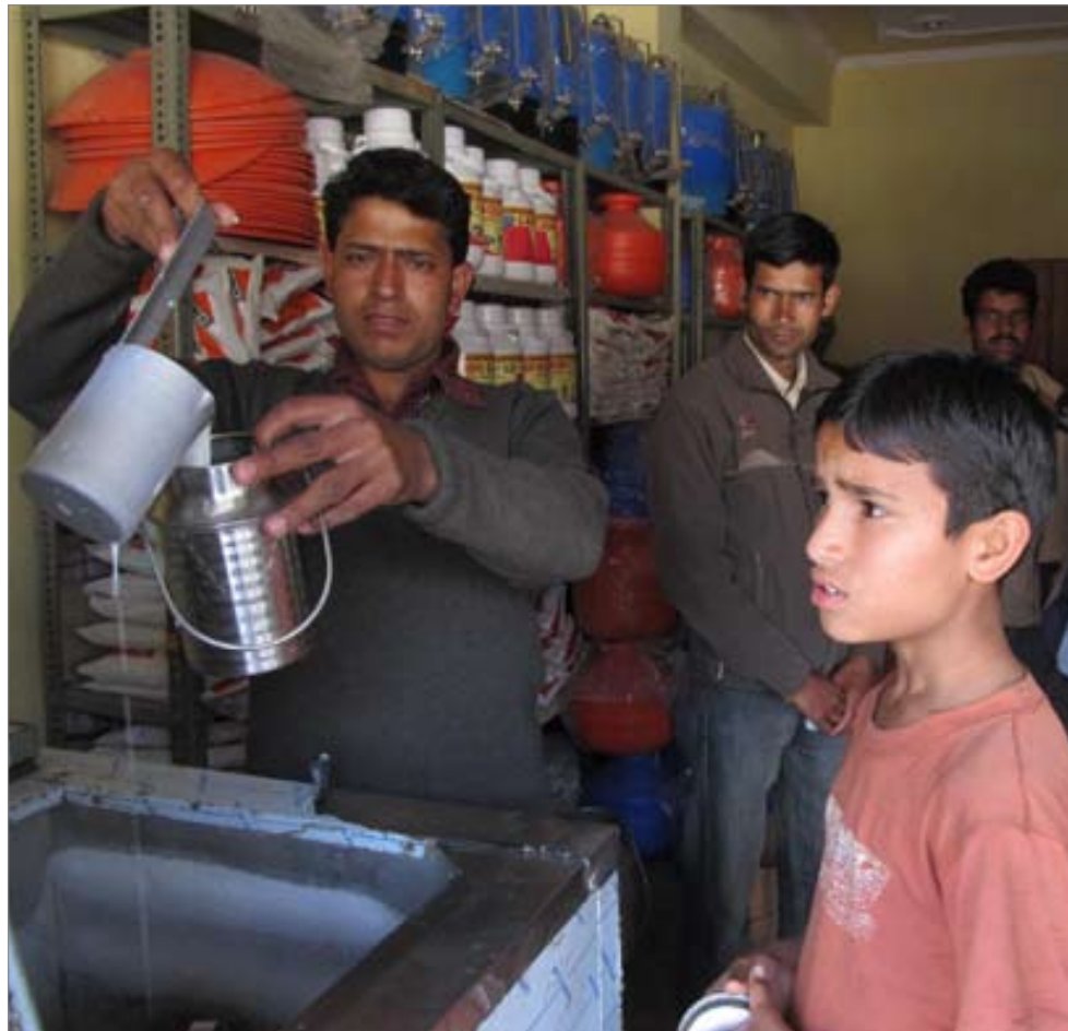
Raja Raghunath Aajeevika Swayat Sahkarita (Federation) office in Godar Patti Gatu is a one-stop-shop for many villagers in Naugaon Block