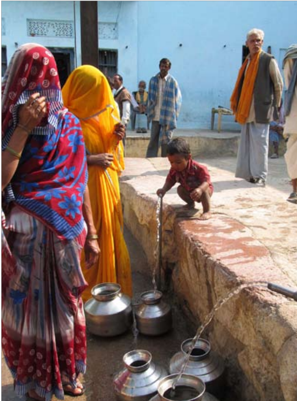
Women of Urdmau village busy filling-up their pots with water, thanks to a 40-litre capacity water tank and a 50-foot bore-well that has saved them from water scarcity.

is unable to keep the motor running for the required number of hours and most times there is a shortage in water supply. “We are planning to solve this problem by buying a generator,” she informs, “but I have a bigger problem...the people don’t want to contribute towards it.”