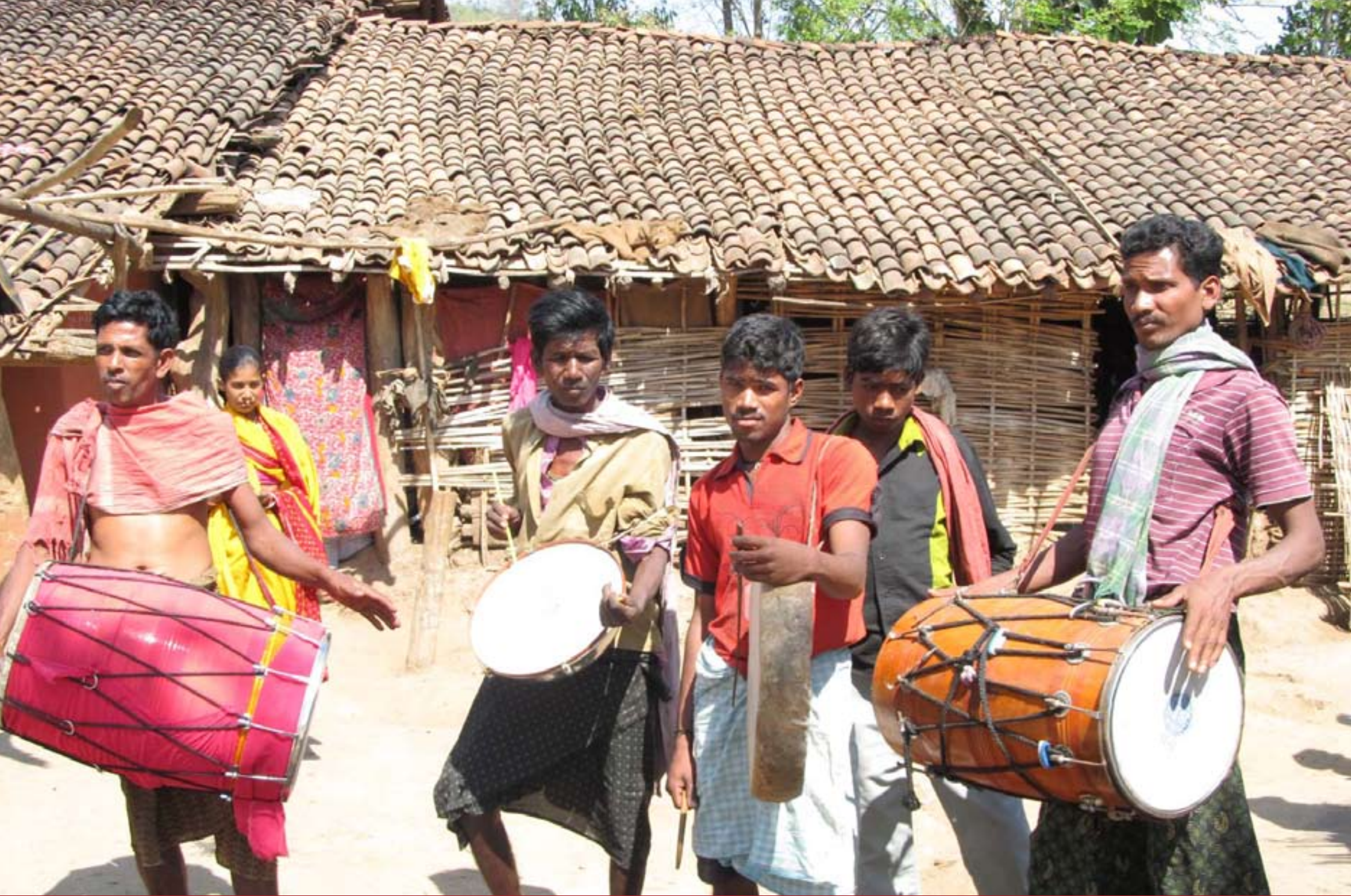
Kalikupa village band displaying the musical instruments purchased via a bank loan taken by Jajiganathan SHG members to develop this business.