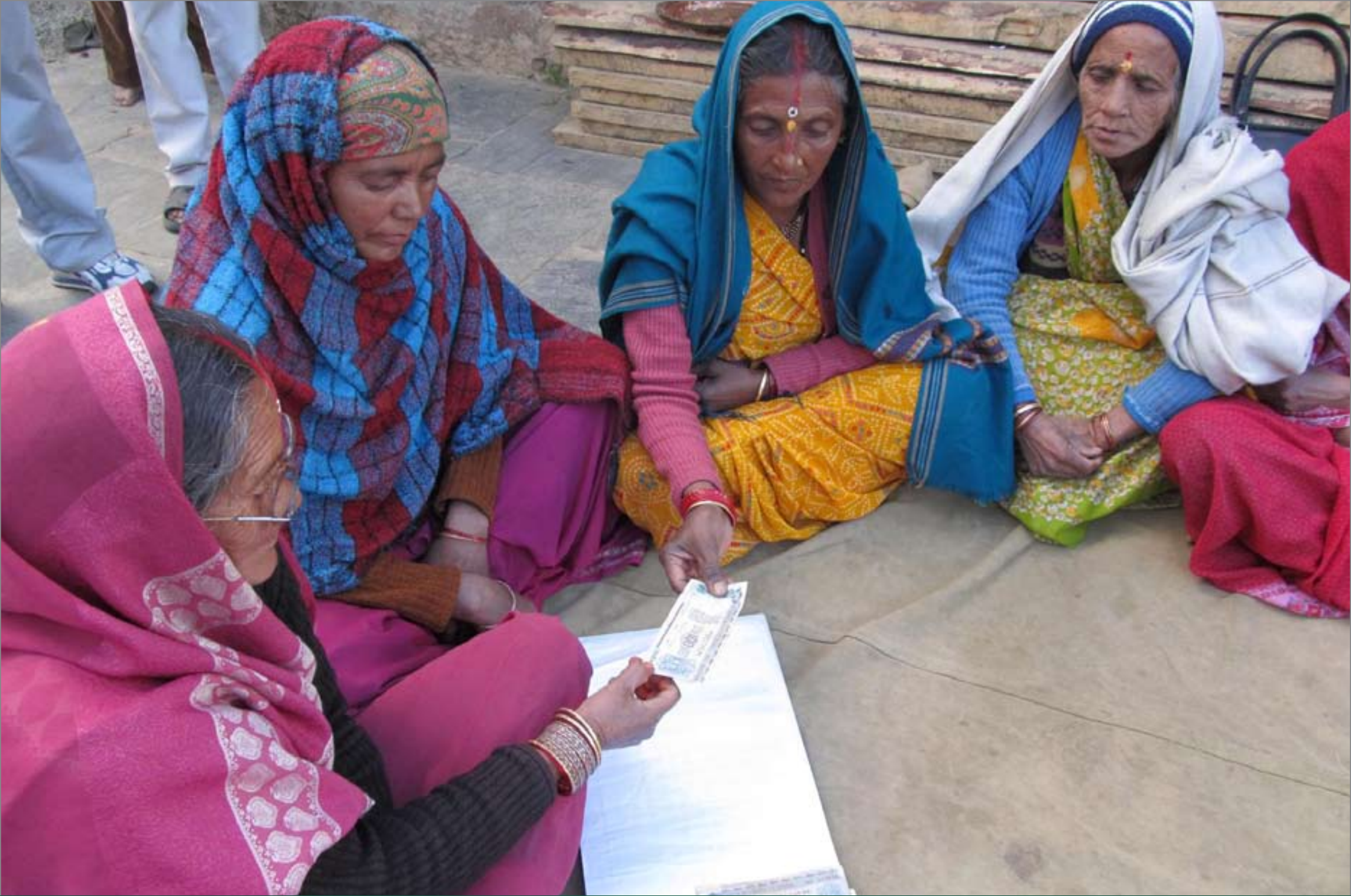
INR 100 (USD 2) is collected as monthly subscription from Prerna SHG members; today they enjoy a circulated fund worth INR 1, 63, 500 (USD 3633)