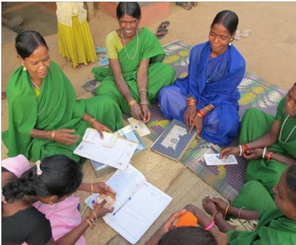
Sukalyani Shakti Dala SHG meeting in progress; some of them are paying their subscription.