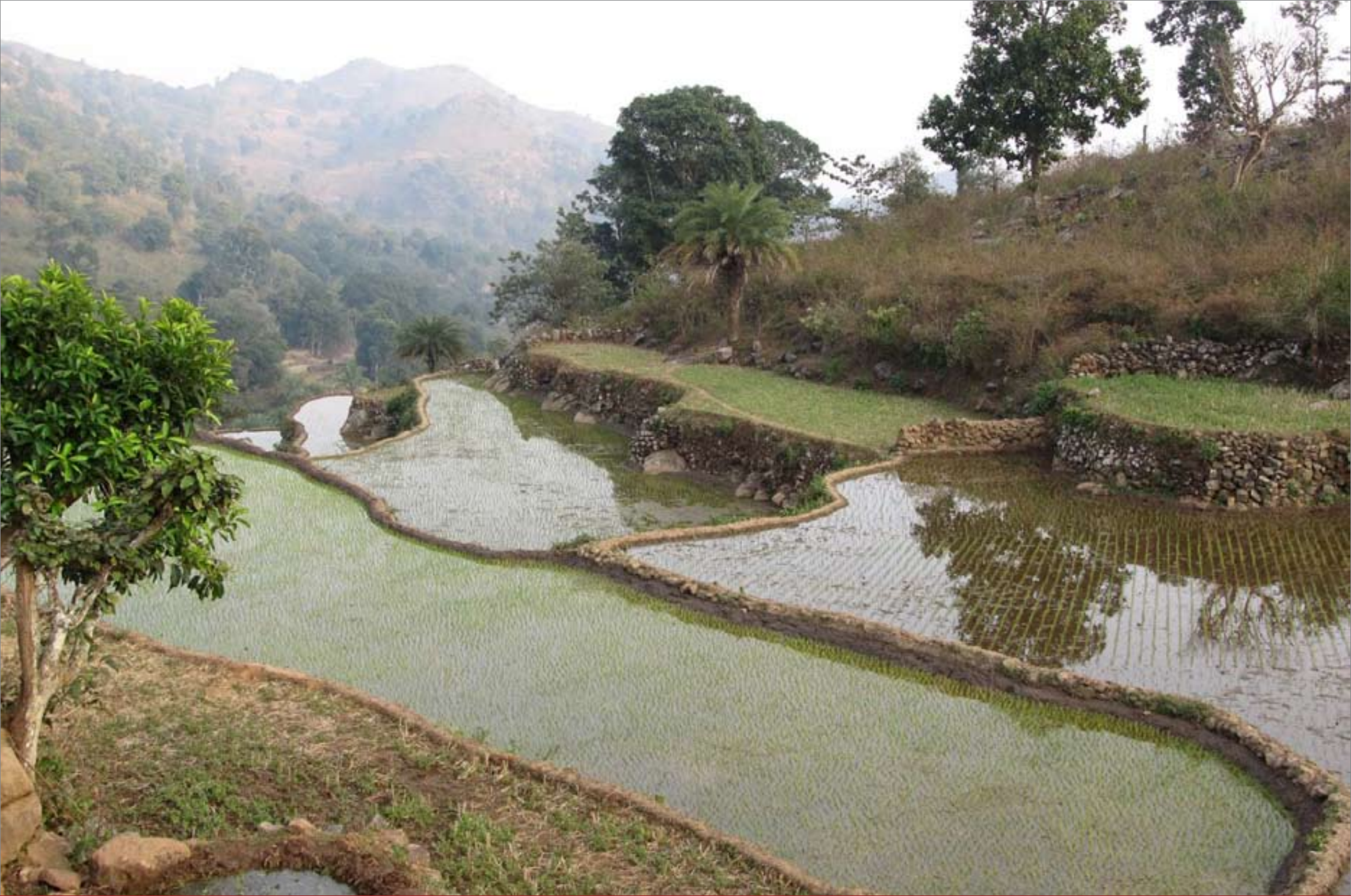
System of Rice Intensification (SRI) method of cultivation adopted by many Tumulo village farmers freeing them from the low-yield perennial problem.