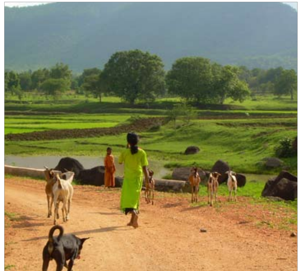
A typical village scene in Lanjigarh Block, Kalahandi District.