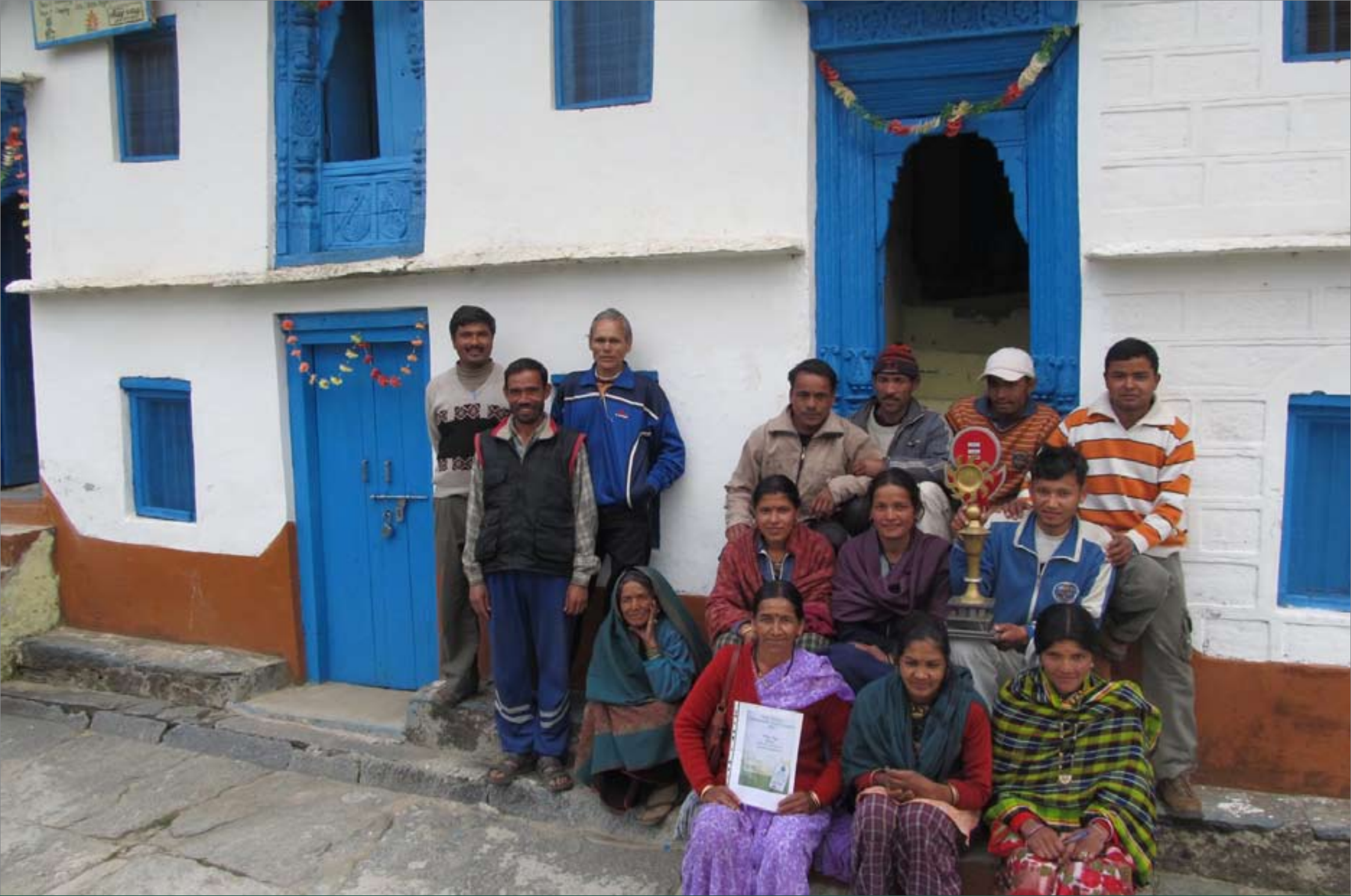
The Supi guest house family at Saryu valley comprising of cooks, housekeeping, tour guides, porters, a manger and well-wishers from the village.