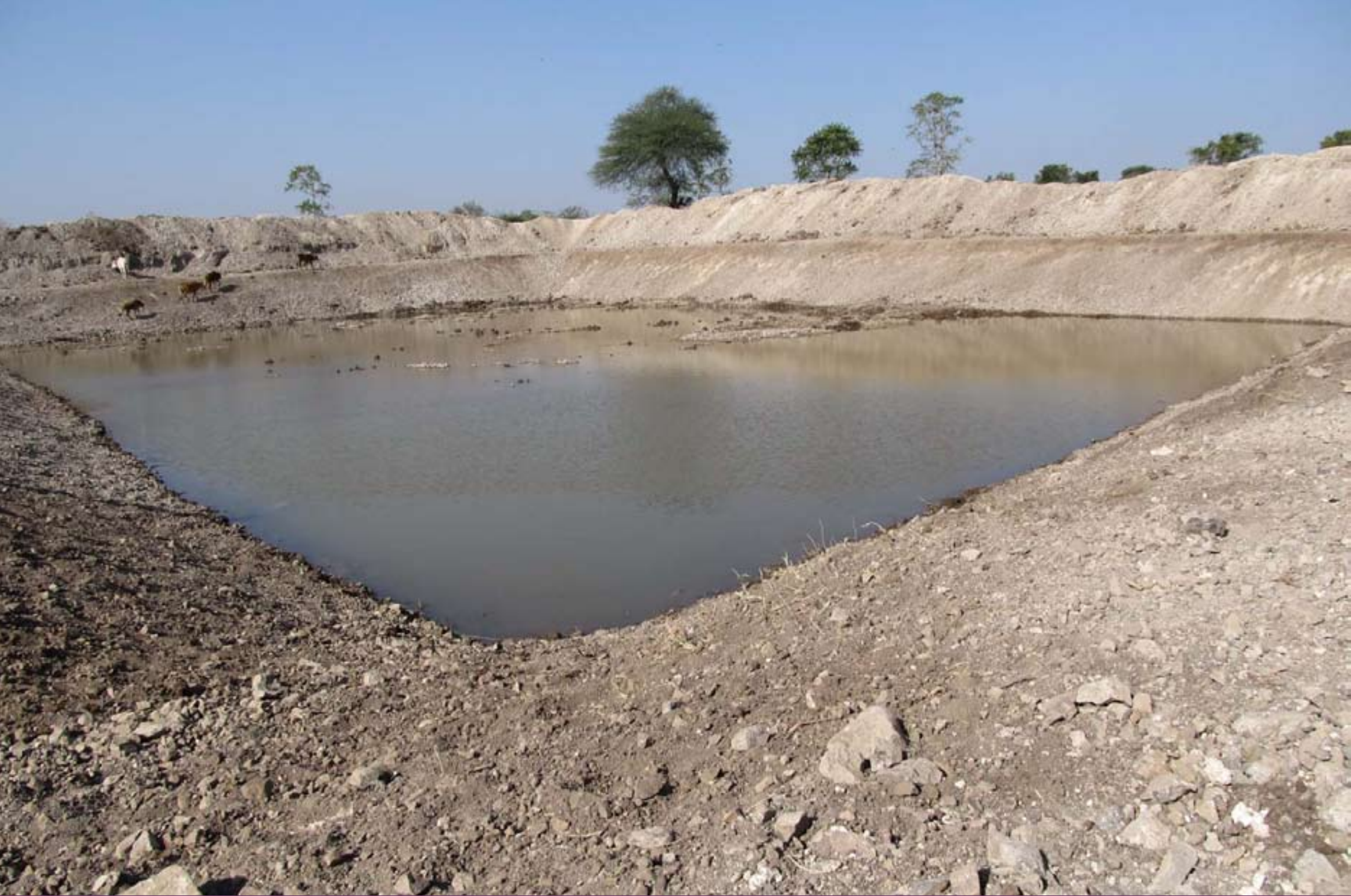
Construction of an artificial lake to hold excess water with the help of the Government supported plan under the National Water Supply Scheme underway in Wani Shambhapur village.