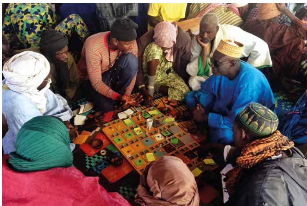
Using participatory modelling of land use in the form of role-playing games helps to promote information sharing and negotiations between actors

Territorial approaches promote inclusive development by supporting growth in all regions instead of just focusing on those places or territories in which economic growth is already taking place.